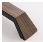
Multi Finitura [con film]