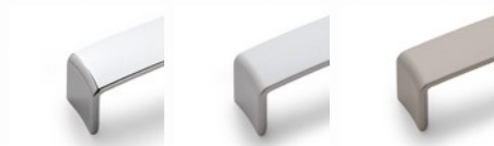
Cromo Lucido Platinato Cromo Spazzolato